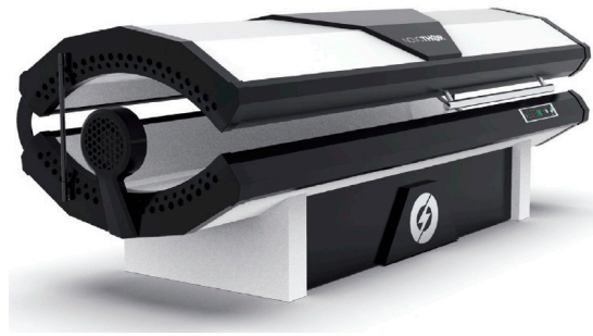
Figure 1. PBM bed by NovoTHOR.